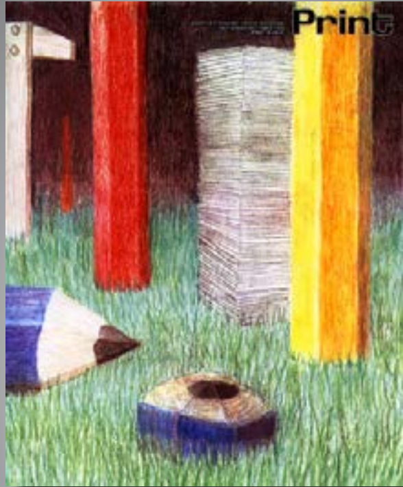
Magazine Cover Design Contest for Print Magazine